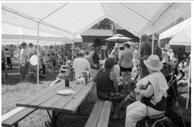
Canada Day audience escapes the sun's rays under our new shade structures at the Gathering Place.